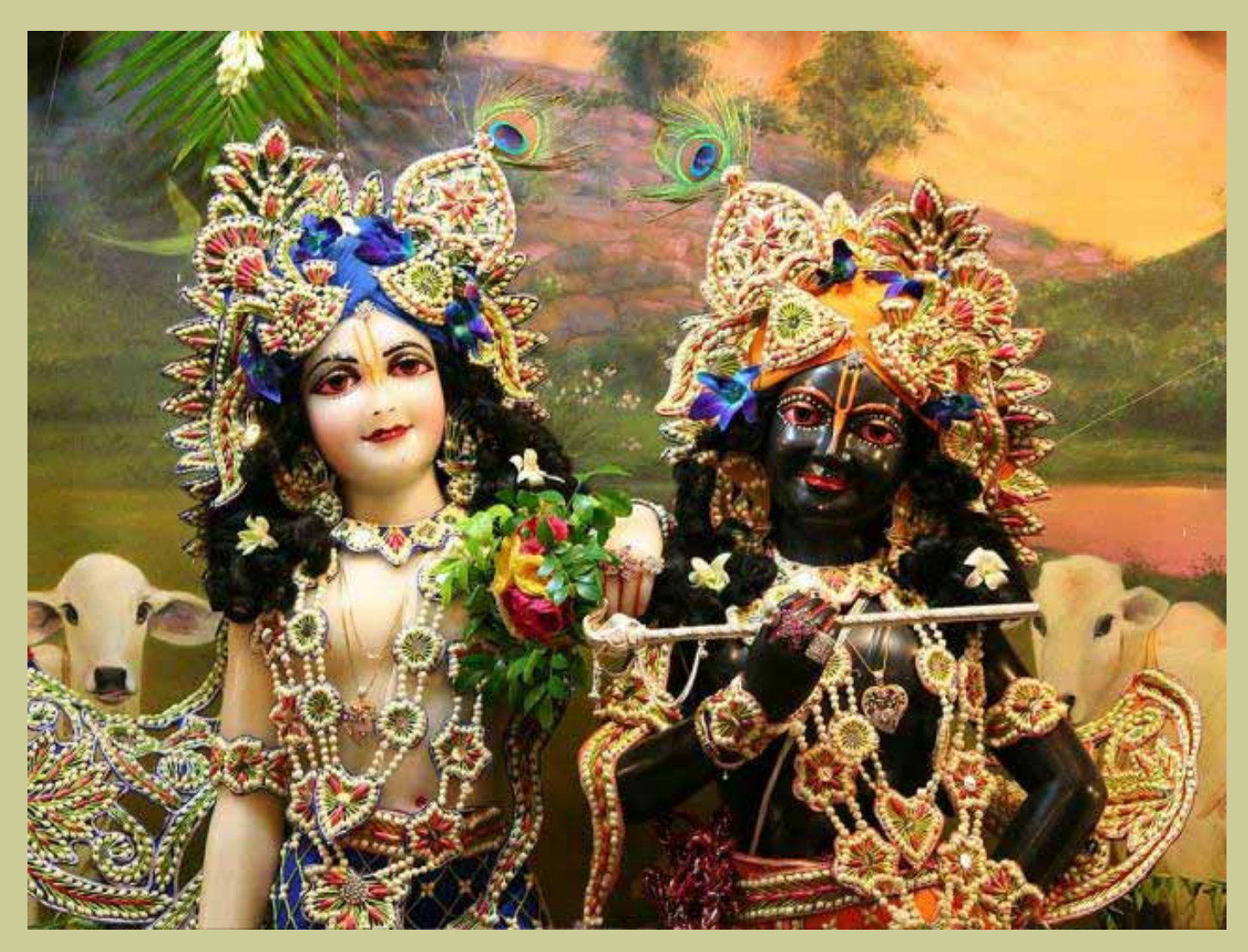
We would like to take this opportunity to show our appreciation and thanks to those who have donated to the Goshala or have adopted a cow or a calf, their names are listed below with the name of the cow they have adopted.